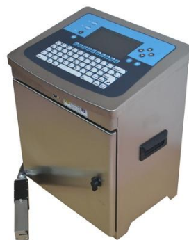
B600 plus CIJ Printer