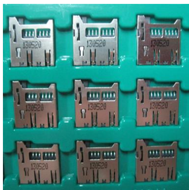
Metal USB Interface